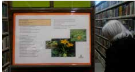
Highland Park Library