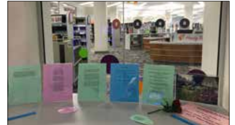
Aurora West Library