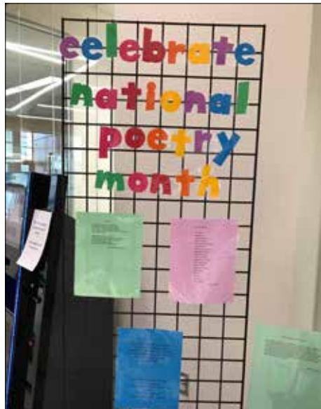
Santori Library, Aurora