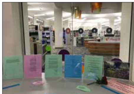
Aurora Santori Library