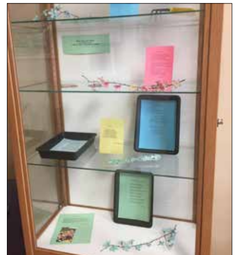
Indian Prairie Library, Darien