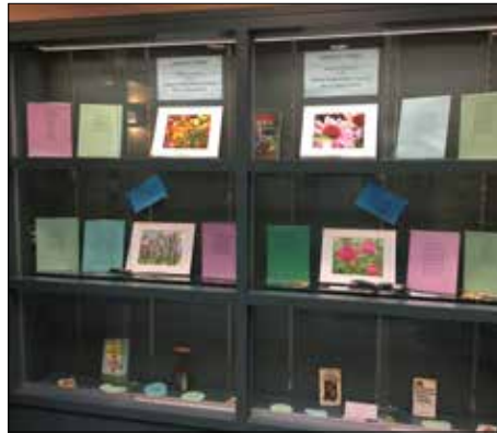
Aurora West Library