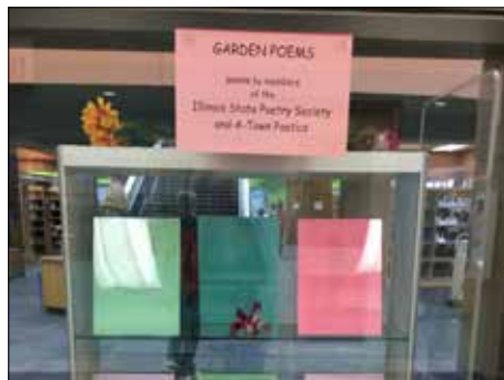
Aurora Eola Branch Library