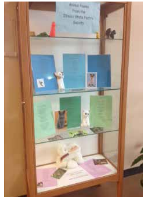
Indian Prairie Library in Darien featured animal-themed poems by eighteen ISPS members during the month of August.

illustrate significant moments in her life as well as the inexorable progression of her poetry. The subjects range from the personal elements of the title poem to historical, social, and cultural interweavings of the textile poems.